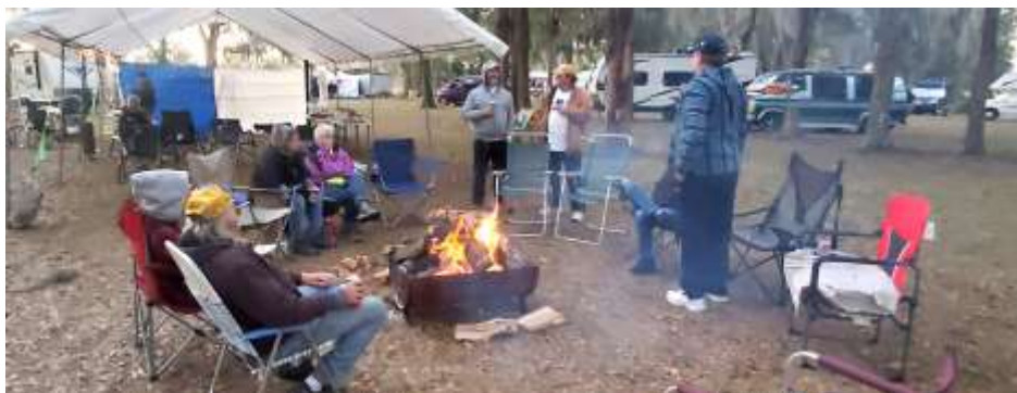
Jan. 2021 FVC meeting