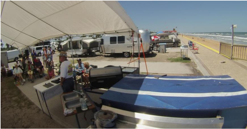
Fore Play Vanners at Beverly Beach – May 2015